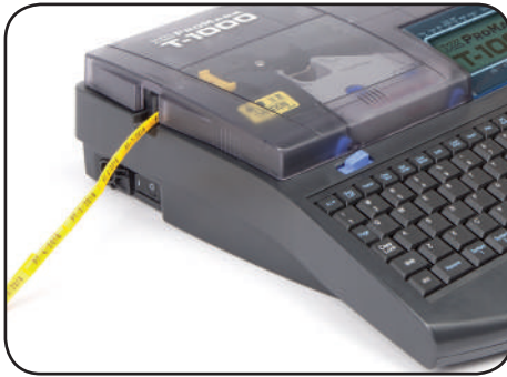
T-1000 prints on Partex profiles. Choose which profile you are printing on and the machine adjusts cutting depth and print position.