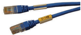
PP+ profile in PTC sleeve