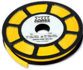
Compactdisc with PO-profile