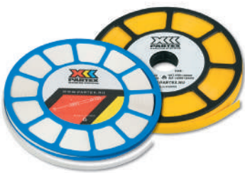
Compacta disc with PP+ profile