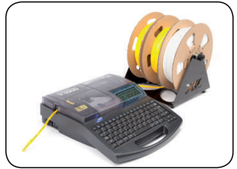
T-1000 is delivered with a reel stand for SN- and DN-reels.