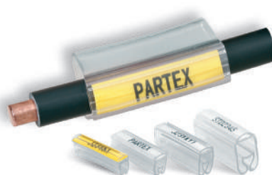
PP+ profile in PT+ sleeve