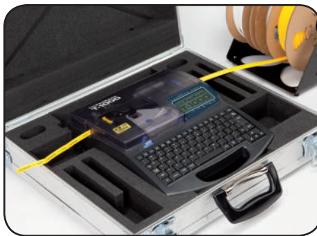
It is possibility to upgrade to a hard aluminium case to ensure safe transportation of the machine.