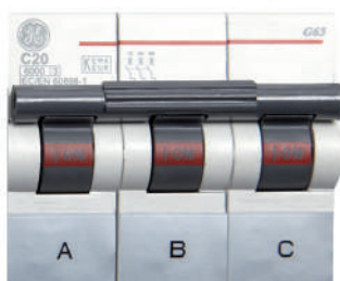
T-1000 also print great on labels