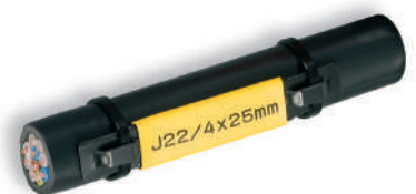
PO-068TW on POH