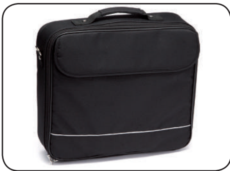
T-1000 is delivered in a soft case