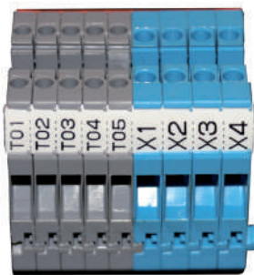
PP+ profile mounted on blocks