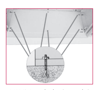
• PNA-140 - Range of reinforced screws to fix the enclosure on a concrete base