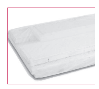
• Safybox:ART enc losures are available in flat pack to reduce the volume in about a 70%