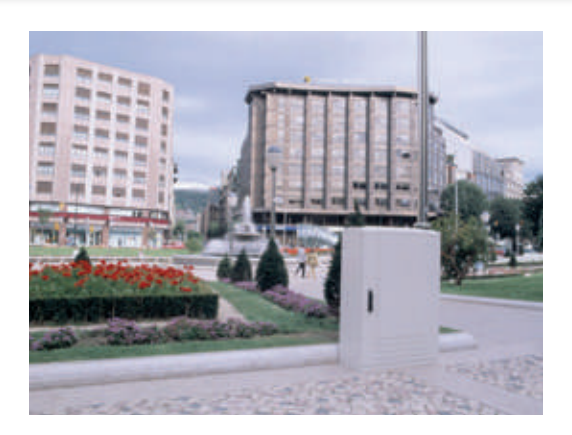
Outstanding design which makes the enclosure the most suitable for urban areas.