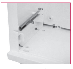
\bullet SDP-300-ART. Range of threaded screws with nuts to adjust the mounting plate at the required depth