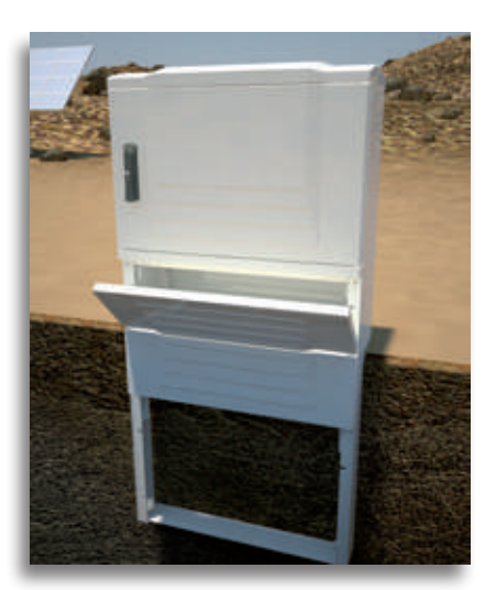
Comprehensive range of pedestals available for all our Safybox-ART cabinets.

The enclosures can be connected together to assemble LV switchgear and controlgear pillars.