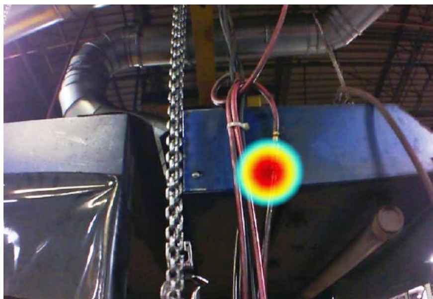
Images taken with the ii900 Sonic Industrial Imager in an industrial environment.

Fluke. Keeping your world up and running.®